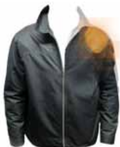
D3O COVERT VEST