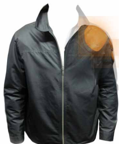
D3O COVERT VEST